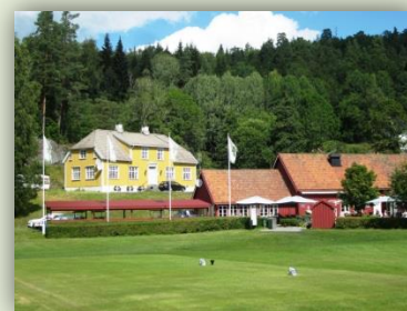
Nes Verk Golfpark